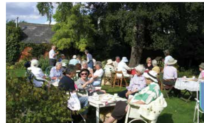
August Garden Party at The Old Forge 2007