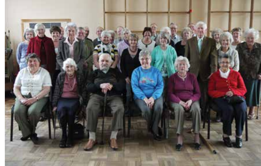
10th anniversary celebration in 2012