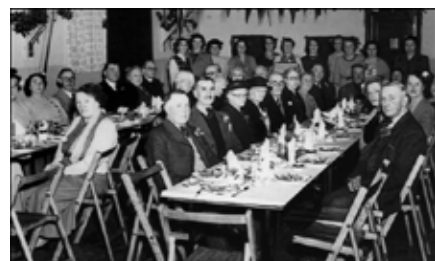
Coronation Event 1953 held in the old POW camp