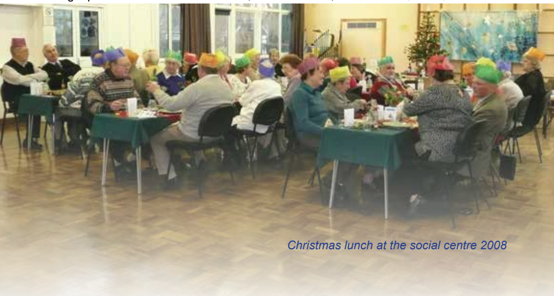
Christmas lunch at the social centre 2008